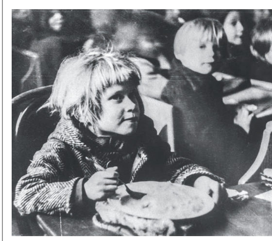
Babies born during the Dutch "Hunger Winter" of 1944 to 1945 had health problems as adults. Findings from Amboseli may help explain why.

The findings suggest that infants who were malnourished in the 2009 drought suffered