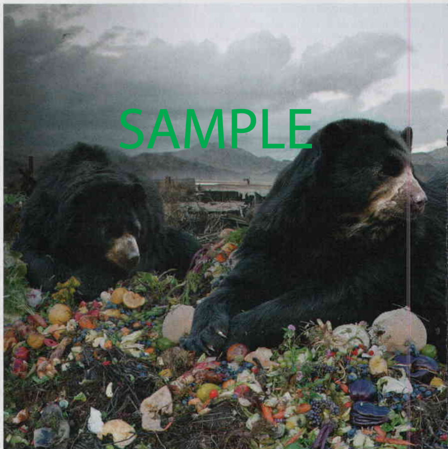
Simen Johan | Untitled #152 , 2008, from the series Until the Kingdom Comes

For King, it's not enough that two animals spend time near each other or greet each other enthusiastically. She'd use the term friendship only if the animals put some effort into their relationship—by