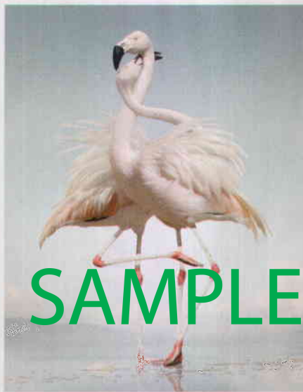
Simen Johan | Untitled #163, 2011, from the series Until the Kingdom Comes

But that day Nicklo was not whacking fish on her own. She was on the hunt with an unrelated old female named Black Tip Double Dip. The pair of dolphins drove the mullet schools from differ-